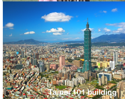
Taipei 101 building