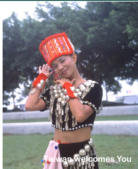
Taiwan welcomes You

After breakfast and transfer to airport for your flight to return home or linger longer in Taipei or take an extension to Hong Kong, Thailand, Malaysia or Singapore.